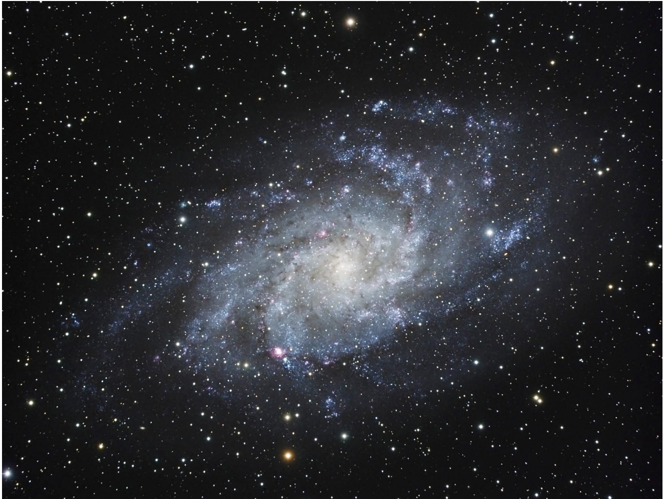
Messier 33, the Triangulum Galaxy, one of the deep-sky objects featured in this month's "Skies."