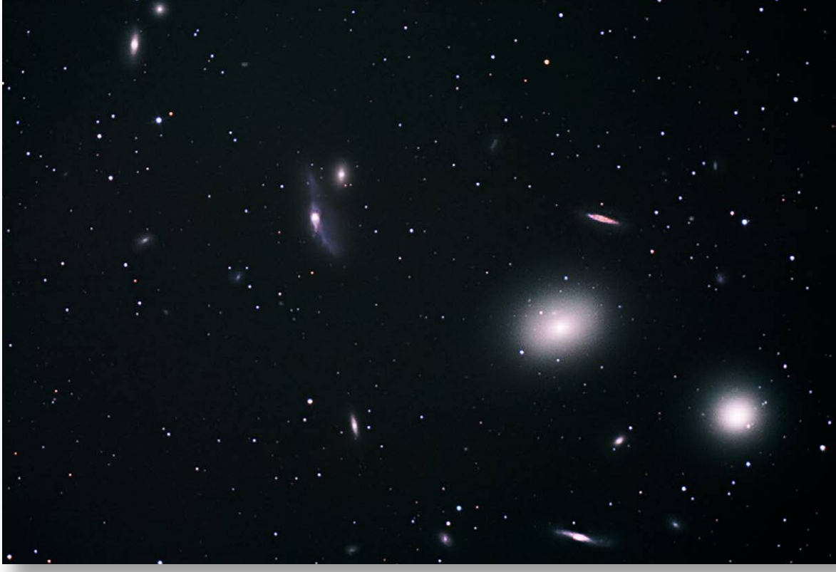
Markarian's Chain, a part of the Virgo Cluster (see "May Skies"). Image exposed with Canon 450D through AstroTech AT8IN f/4 imaging Newtonian; 90 minutes of RGB, processed with Nebulosity 3.1 and Photoshop CS5.