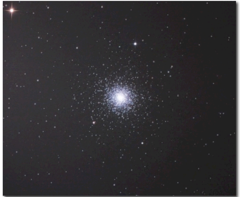
M3 (NGC 5272)