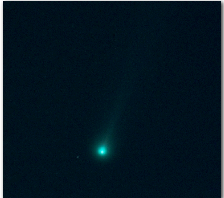
Photos, clockwise: Above right: Ricardo Viera shot ISON on November 19. Below right, Darrell Dodge shot ISON on October 26th at the Dark Site. Details: modified Canon 450D, through an 8-inch Ritchey-Cretien at f/8. 12 x 90 sec. RGB. Processed with Nebulosity and CS5. Below left is Sorin's contribution: ( http://soggyastronomer.com ) on November 20th, 2013 at 5:50-5:54 A.M. from Observatory Park in Denver (heavy light pollution). Three 1-min subs taken with 1-minute intervals between tracking on the comet. Canon t3i prime focus with 6-inch f/9 1370mm Astro-Tech Ritchey-Chrétien astrograph plus Astro-Tech field flattener.

ISON isn't the only comet we have to look at! C/2013 R1 Lovejoy is still putting on a good show. Check http://earthsky.org/space/how-to-see-comet-lovejoy-c2013-r1-charts-photos for a good finder chart. ★