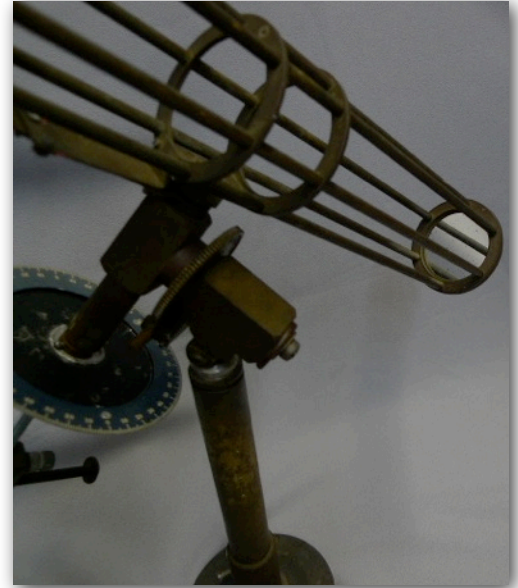
THE 47.5MM PRIMARY MIRROR OF THE BRASS NEWTONIAN