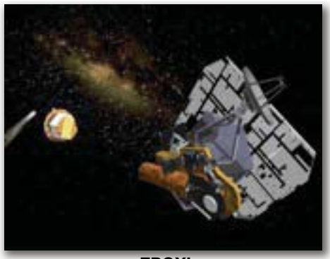
EPOXI Artist's concept of Epoxi spacecraft.

As noted in the Colorado Astronomy Day article, the DAS will be supporting the NASA educators' EPOXI workshop at DMNS, which will be held on Colorado Astronomy Day. There is nothing like a targeted observing program with clear