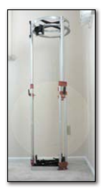
The center photo shows the complete Dave Shouldice Design with tube and base connected and Trusses fully extended. The above photo shows the Truss tube that represents Phase One of the proposed Student Scope.