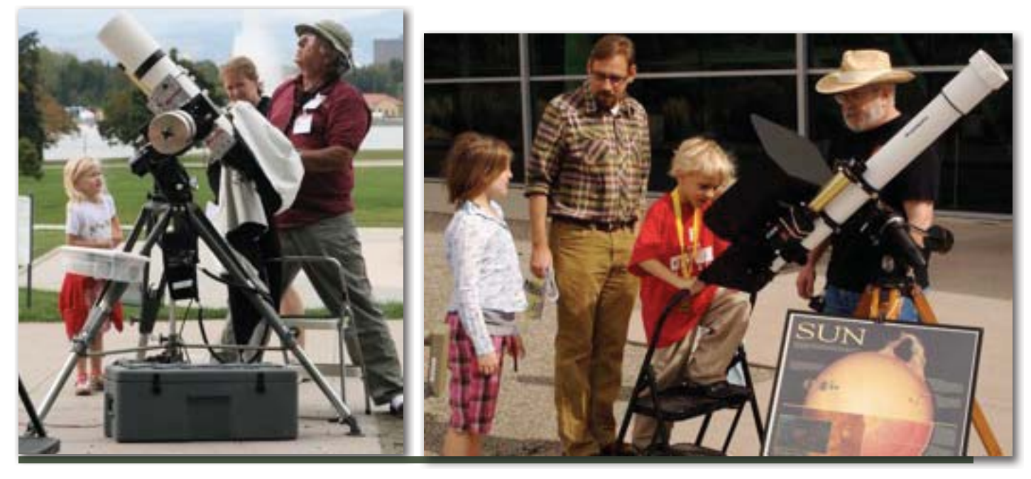
One Mile Nearer the Stars