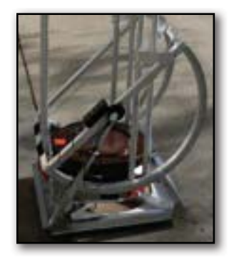
Photo at top left shows connection points for the mirror cell, and below it the base and rocker box in more detail.