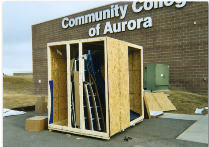
Above: The complete (disassembled) observatory arrived in a 500 cubic foot box.

each ring). Two things we found out "right out of the box" were that (1.) you're not going to build this in a day by yourself and (2.) these semi -rigid rings and dome sections flex so construction on a windy day can be dicey. Trying to maintain a perfect (or as near as possible) circular configuration during assembly is NOT easy and requires several hands. These buildings are also not completely weather tight so some amount of time has been spent sealing the seams. The observatory dome and shutter are fully motorized and may be slaved to a computer. If you purchase one of these observatories it will certainly help to have a work crew with someone assisting who has done this before!