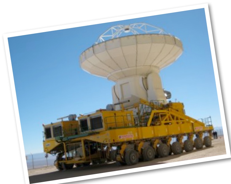
Figure 3. After moving Vertex antenna #2 from the Assembly Building, the transporter sets it down beside #1 on a pad (NRAO eNews, August 2008).

To get to this point, political and economic hurdles had to be overcome. Initial concept involved partners from North America and Europe, has since been extended to include East Asia and Chile. Since the antennas for ALMA are the single largest investment in the project, each of the host governments, for