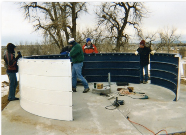
Left: Assembling the observatory on the grounds of the Community College of Aurora.

Finally, we expect the observatory to be completely operational in early 2009. Once this is accomplished we plan to have a special evening of observing for the DAS. We'll see you then.