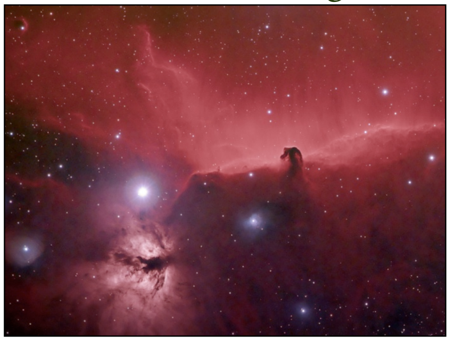
The Horsehead and Flame Nebulae (Barnard 33/IC434 and NGC 2024)

The Horsehead Nebula (also known as Barnard 33 within the bright nebula IC 434) is a dark nebula in the Orion constellation. The nebula is located just below Alnitak, the easternmost star of Orion's Belt, and is part of the much larger Orion Molecular Cloud Complex. This image was taken with an SBIG ST2000XM through a Stellarvue 80mm f/4.8 telescope on a Takahashi mount.