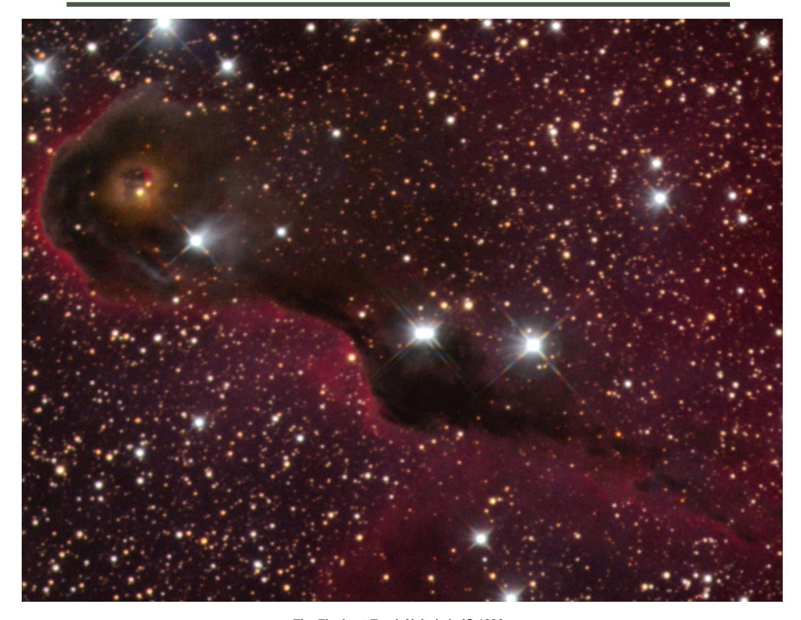
The Elephant Trunk Nebula in IC 1396

Worth a two-page spread, the Elephant's Trunk nebula is a concentration of interstellar gas and dust in the IC 1396 star cluster and ionized gas region located in the Cepheus constellation about 2,400 light years away from Earth (thank you, Philip Good, for that description). Joe shot this image at Rocky Mountain Star Stare 2008 with an SBIG ST-2000XM ccd camera through his 18-inch f/4.5 JMI Newtonian telescope. It's a mosaic of two frames of 15-minute each LRGB exposures.