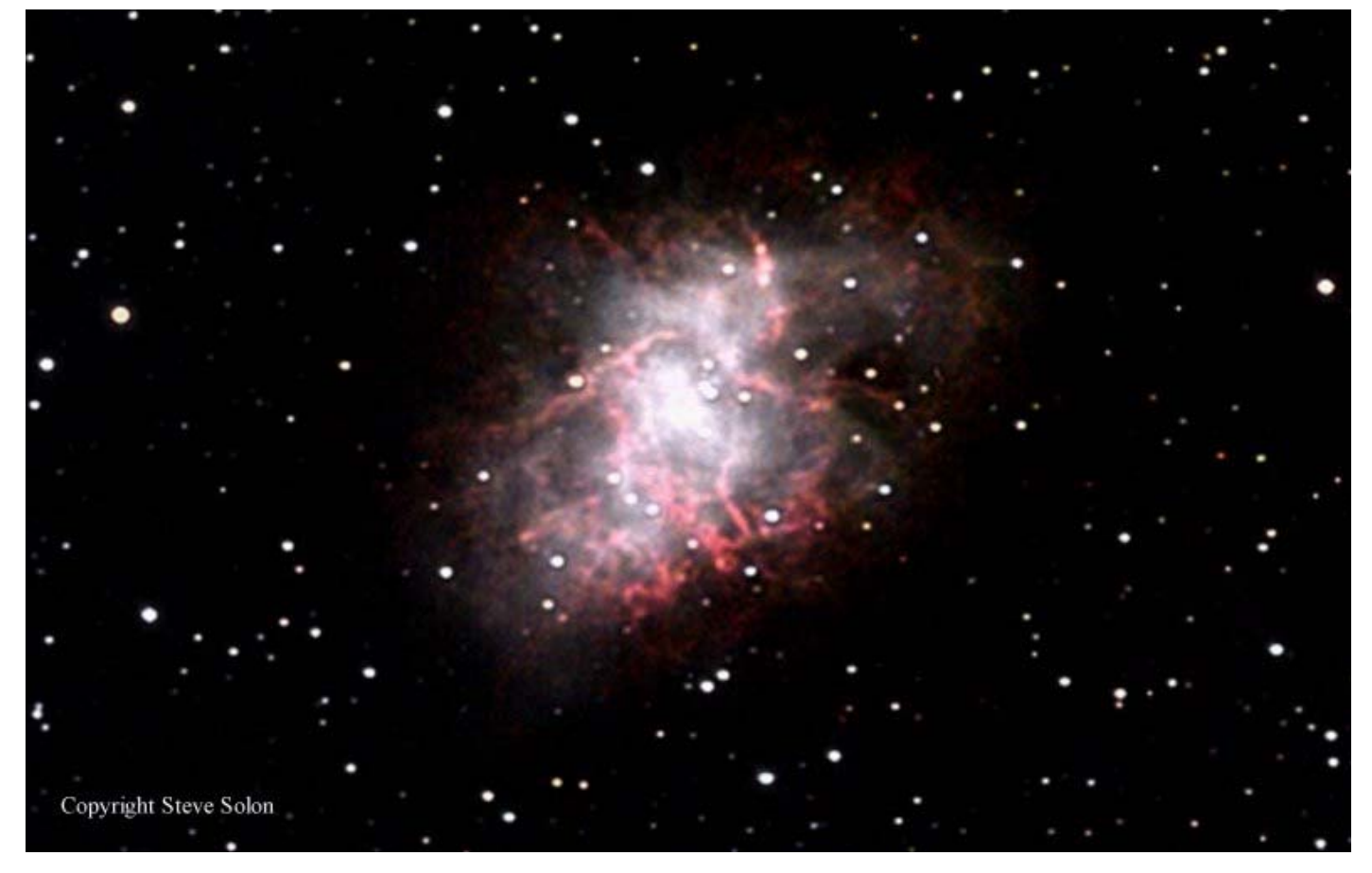
M-1, the Crab Nebula. A sample of Steve's fine imaging.