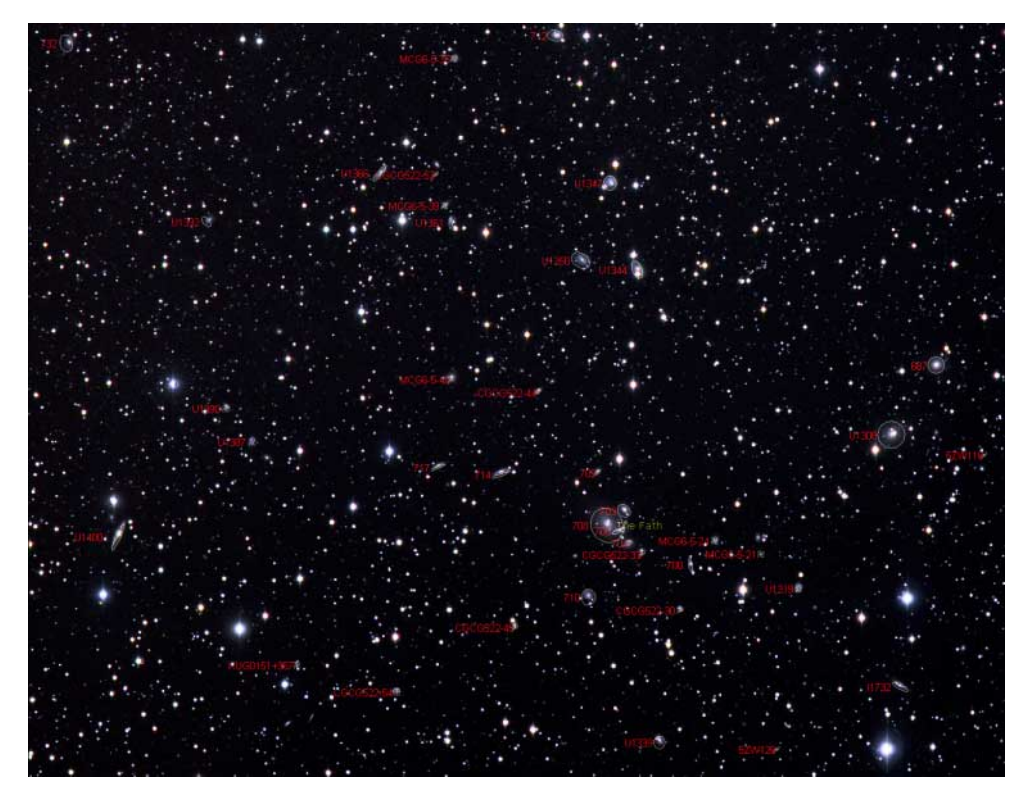
Abell 262 Galaxy Cluster from Page 1. Using TheSky software (Software Bisque), Chris Tarr labelled about 30 of the galaxies in the image. He points out a good barred-spiral (U1350) that shows the bar segmenting the center.