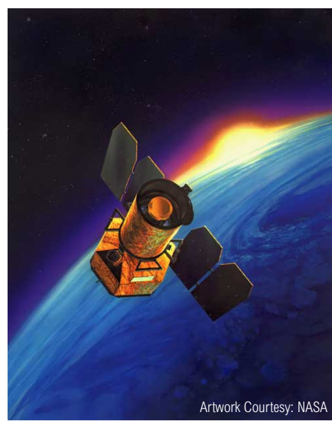
The GALEX (Galaxy Evolution Explorer) mission will do a broad survey of galaxies in various stages of evolution and identify interesting objects for further study by the Hubble Space Telescope.

This article was provided by the Jet Propulsion Laboratory, California In-