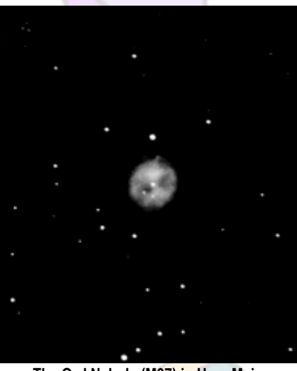
The Owl Nebula (M97) in Ursa Major

This is no ordinary observatory. This is a monument that speaks about the heart, dreams, goals, and ambition of three friends. It is truly remarkable what these men put together for the sole desire to observe, learn, and stargaze. They served hot chocolate, coffee, cookies, and offered the use of their facilities inside. We knew it would be chilly but we were not prepared for how COLD it is after dark, in November, in the middle of nowhere! Of course our guides were well equipped to weather the night. The tour began with Terry explaining what type of telescopes they use and what they do. Terry operated the SCT-14 with a CCD (AP7) camera. This is a massive robotic telescope. He uses TheSky (Software Bisque) in conjunction with the scope. This software enables Terry to move the telescope and achieve different pictures with literally a click of the mouse.