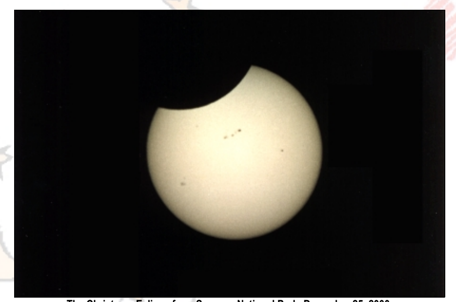
The Christmas Eclipse from Saguaro National Park, December 25, 2000. C-90 at prime focus with a Nikon FM2 camera, Kodak Select+ 400 film, 1/1000-second exposure taken at 9:31 a.m. MST. (Nice sunspots!)